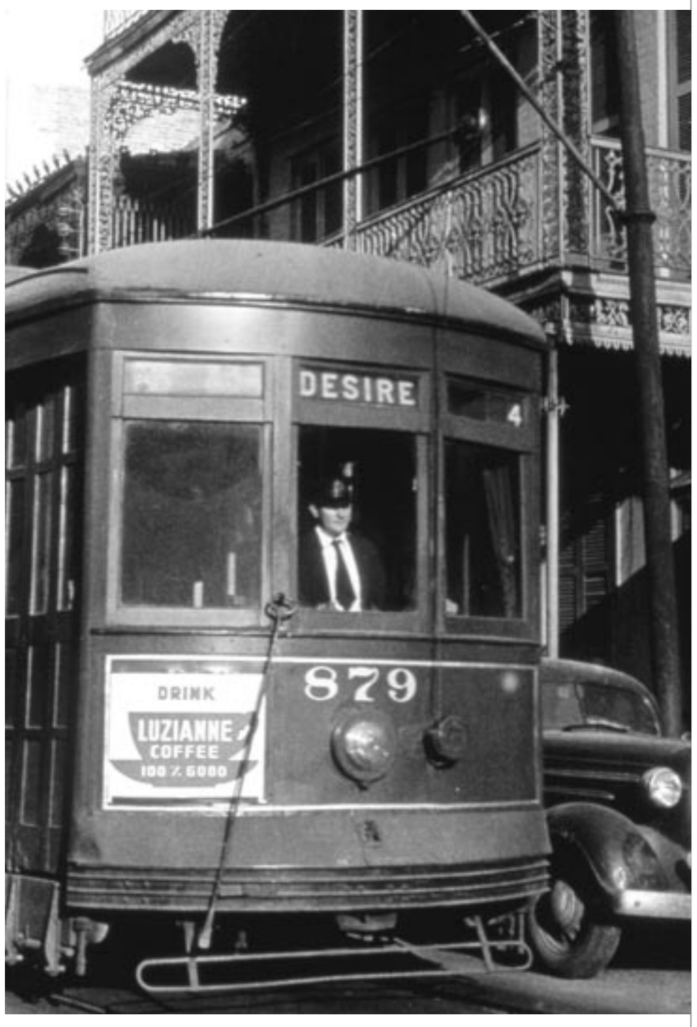
Photograph by Todd Webb, 1947. Courtesy of The Historic New Orleans Collection.

Acquiring the records of active organizations may bring the legitimate needs of the donor organization into conflict with the overall good of the