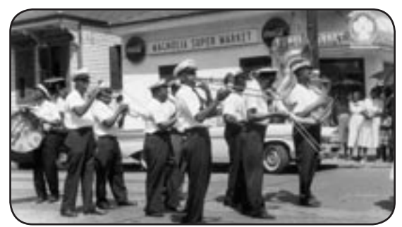
Young Tuxedo Brass Band at the corner of Magnolia and Jackson, 1958