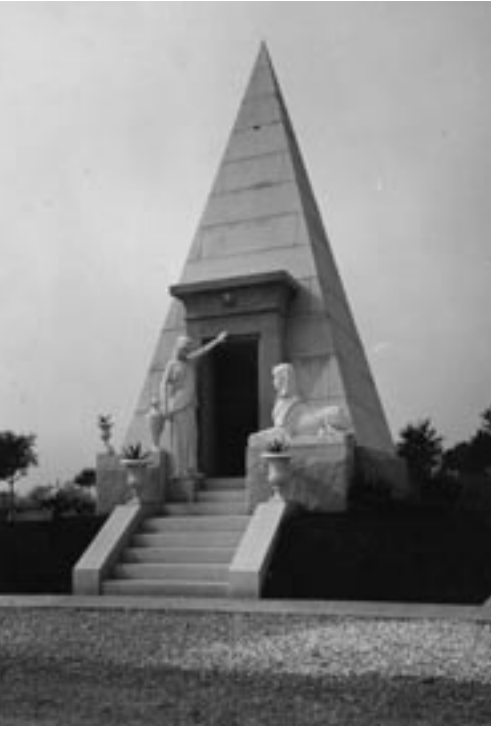
Brunswig Tomb, Metairie Cemetery, New Orleans, C. Milo Williams, photographer, Southeastern Architectural Archive, Special Collections, Tulane University Library, ca. Early 20th century.

Wars and political conflicts exact a terrible human cost, but they also result in the irreparable loss of cultural heritage. Only by examining the deliberate and accidental destruction of archives, libraries, and museums can we learn how to avoid such profound loss in the future. This session explores the causes and consequences of such attacks during wartime and the archival community's role in establishing widespread awareness, archival solidarity, disaster planning, and preservation initiatives. Readings: www.albersfoundation.org/SAA05.