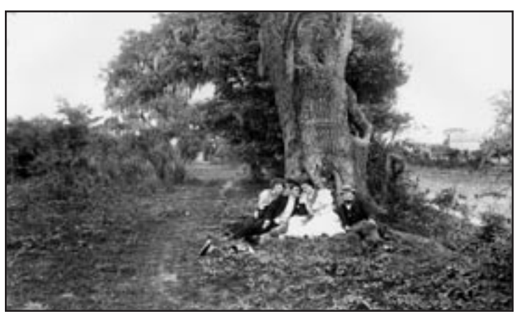
Unidentified, c. Early 20th century.

Join your student colleagues in the Exhibit Hall to view their poster presentations, ask questions, share your ideas, and network. In 2005, for the first time, posters will be judged by a panel and awards will be given for best individual poster and best student chapter poster. (Thursday, August 18, 5:30 - 7:30 pm, and Friday, August 19, 9:30 am - 4:00 pm)