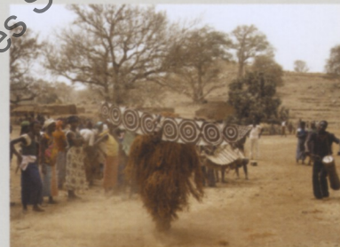
Butterfly mask performance Dosi peoples, Burkina Faso Photograph by Robert Pringle, 1988

The field photographs, consisting of more than 300,000 images of African artists, leadership, masquerades, architecture and natural landscapes and reflect the work of both Western and indigenous photographers. The most outstanding field collection is the work of photographer Eliot Elisofon, whose images focus on the arts and cultures of West and