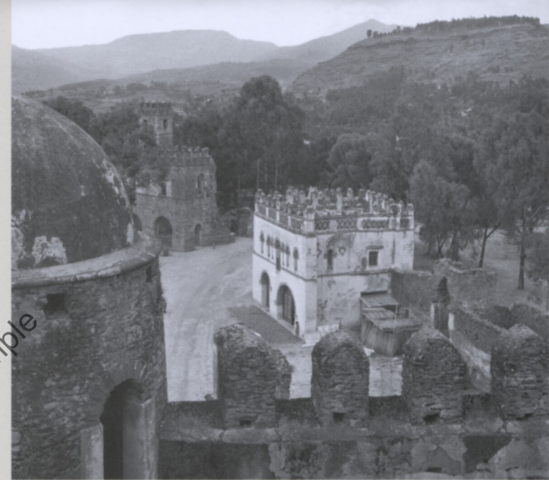
Ancient city of Gondar, Ethiopia