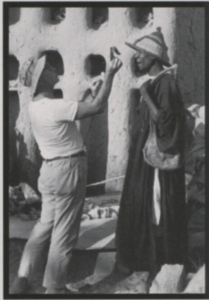
Eliot Elisofon photographing Dogon blacksmith (detail) Ogul du Haut village, Mali Photograph by Maya Bracher, 1971 EEPA EENG 10693

association with the National Museum of African Art began as a founding trustee in 1964. Upon his death in 1973, Elisofon's extensive collection of African materials—including over 50,000 black-and-white negatives and photographs, 30,000 color slides and 120,000 feet of motion picture film and sound materials—was donated to the museum. This bequest became the foundation for the Eliot Elisofon Photographic Archives.