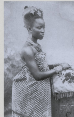
Young Fante woman Cape Coast, Ghana Photographer unknown, c. 1885–1910 Ghana Photographic Album EEPA 1995-0018-0002

association with the National Museum of African Art began as a founding trustee in 1964. Upon his death in 1973, Elisofon's extensive collection of African materials—including over 50,000 black-and-white negatives and photographs, 30,000 color slides and 120,000 feet of motion picture film and sound materials—was donated to the museum. This bequest became the foundation for the Eliot Elisofon Photographic Archives.