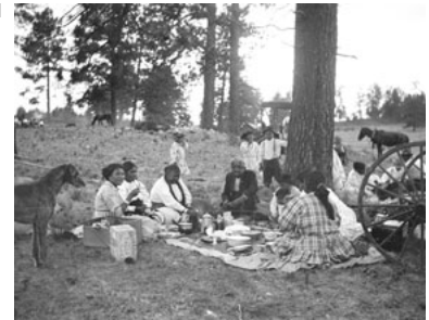
Mescalero Apache and/or Chiricahua Apache men, women, and children at a picnic, Mescalero Apache Reservation, New Mexico, ca. 1916. (N53268)