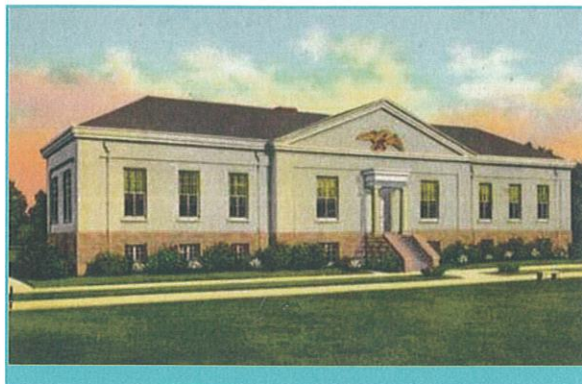
Postcard of the Mint Museum of Art, 1940.