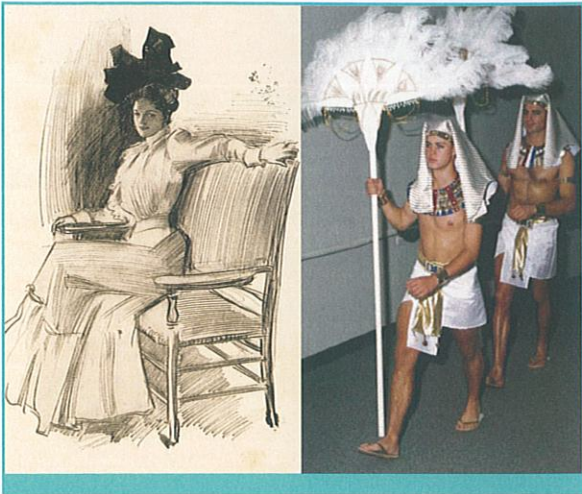
Illustration by Charles Dana Gibson from his limited edition portfolio The Education of Mr. Pipp. New York: E. H. Russell, 1899. // Photograph from Ramesses the Great: The Pharaoh and His Times opening gala, 1988.