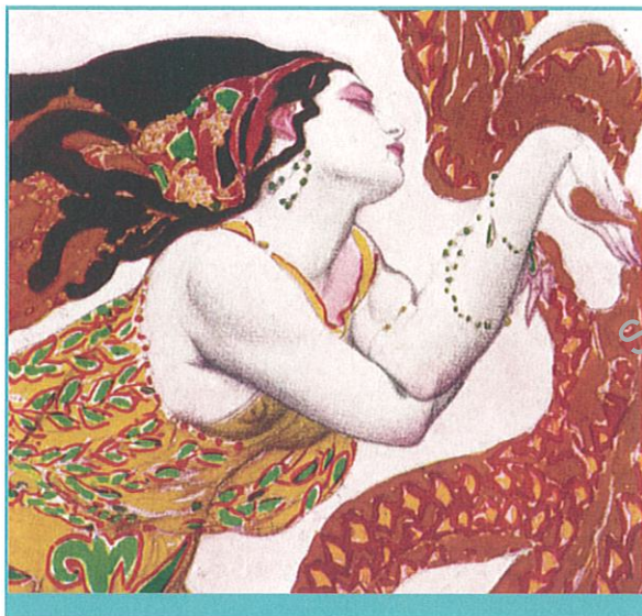
Detail of "Bacchante in Narcisse" by Leon Bakst from Souvenir Serge de Diaghileff's Ballet Russe . New York: Metropolitan Ballet Company, Inc., 1916. From the special collections of The Mint Museum Library.

In addition, four Resource Centers at Mint Museum Uptown provide selected print and multimedia resources dealing specifically with adjacent special exhibitions and the permanent collections of contemporary art, American art, and studio craft and design.