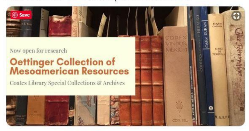
1:53 PM · Aug 6, 2019 · Twitter Web App

Interested in Mesoamerican manuscripts? The Oettinger Collection of Mesoamerican Facsimiles and Resources is now available for use in Special Collections.