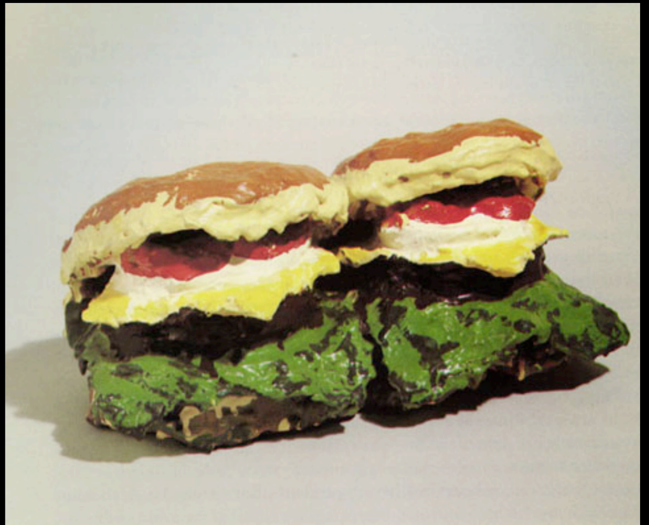
Claes Oldenburg, "Two Cheeseburgers With Everything"