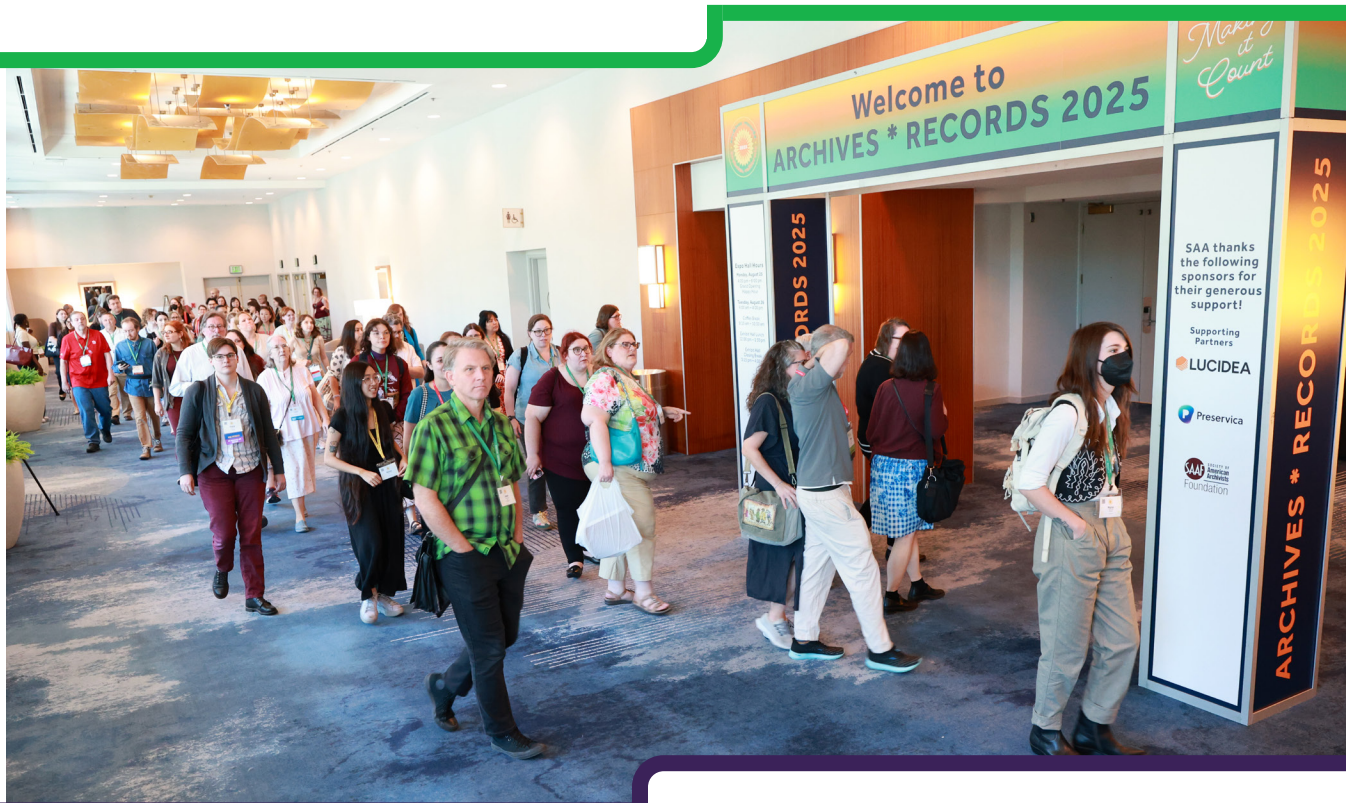
All conference attendee photos courtesy of Craig Huey Photography, LLC.

On occasion, a photographer may take photos, videos, or other recordings of attendees at ARCHIVES*RECORDS 2026 or of people participating in conference functions or activities. Please be aware that these photos and recordings are for SAA's use and may appear in SAA conference programs, catalogs, brochures, journals, website, in other SAA materials or as part of SAA media outreach efforts. Your attendance at any SAA conference event constitutes your permission and consent for SAA to utilize your image, likeness, and/or recorded voice as described herein.