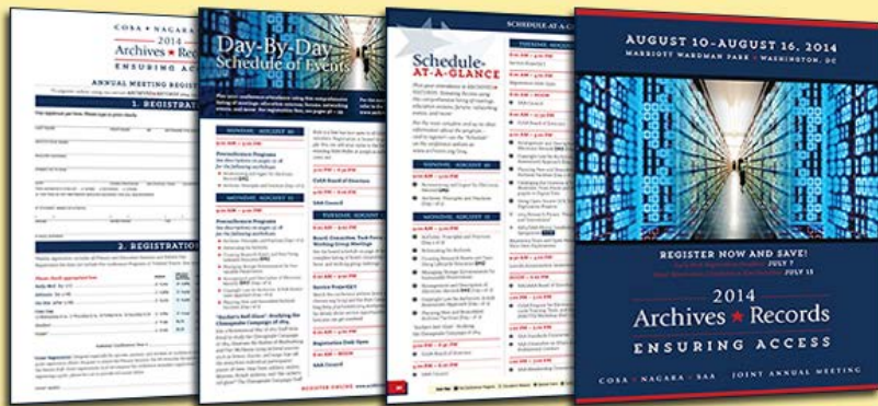
Archives ♦ Records: Ensuring Access — Washington, D.C., August 10-16