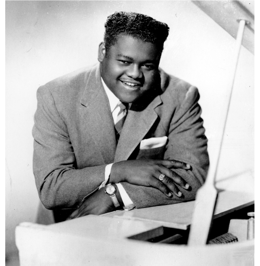
NBC News, Fats Domino, New Orleans Rock Pioneer and Piano Prodigy Dies at 89